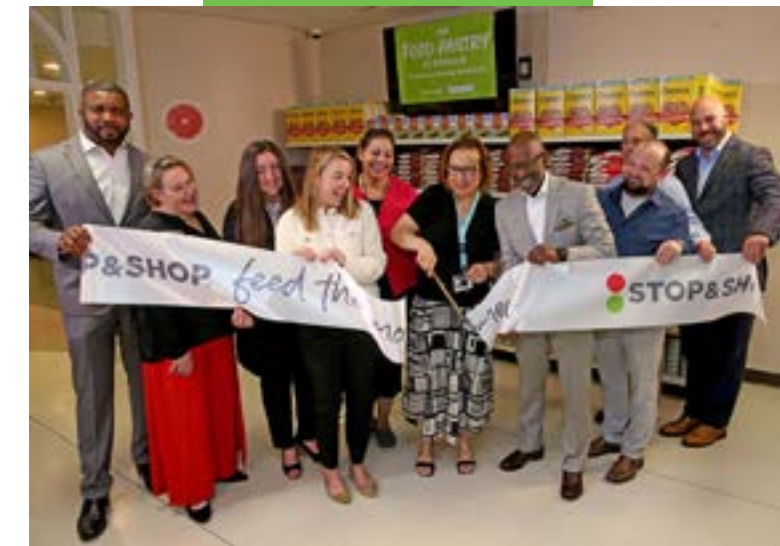
This June, we hosted the official ribbon-cutting ceremony for the Neighbors Helping Neighbors Food Pantry sponsored by Stop & Shop.

STOP & SHOP SPONSORS DIMOCK'S "NEIGHBORS HELPING NEIGHBORS" FOOD PANTRY