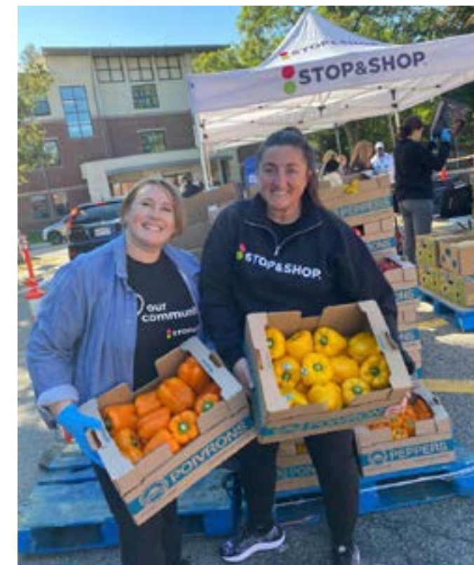
Each month since 2020, Stop & Shop donates hundreds of pounds of nutritious produce and pantry staples to Dimock families in need.

Since then, Stop & Shop has distributed over 140,000 pounds of nourishing food to Dimock families at monthly food distributions and now through Dimock's new permanent food pantry. We are so grateful for Stop & Shop's significant commitment to improving the health of our community and for all of the volunteers who make this work possible!