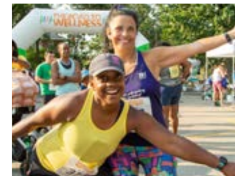
Athletes could barely contain their excitement on race day.