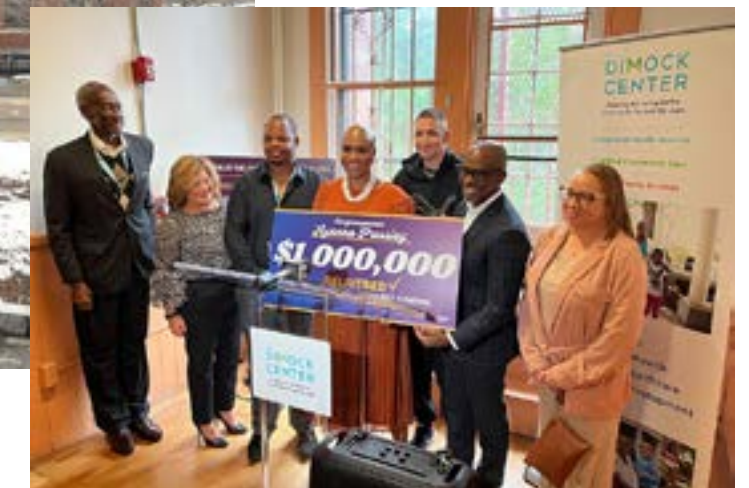
In October, Congresswoman Ayanna Pressley visited Dimock to present $1 million in funds for the creation of the men's CSS program.