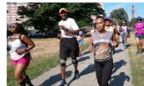
A team of professional coaches led the Road to Wellness community in free group fitness trainings, all summer long.