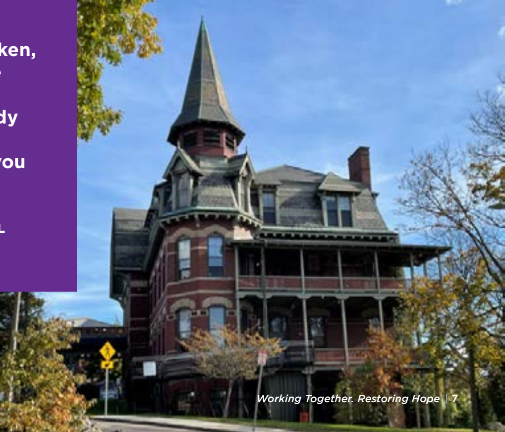
The historic "Z" Building, named after Dimock pioneer Dr. Marie Elizabeth Zakrzewska, will be renovated to create Boston's first post-detox CSS program for men.