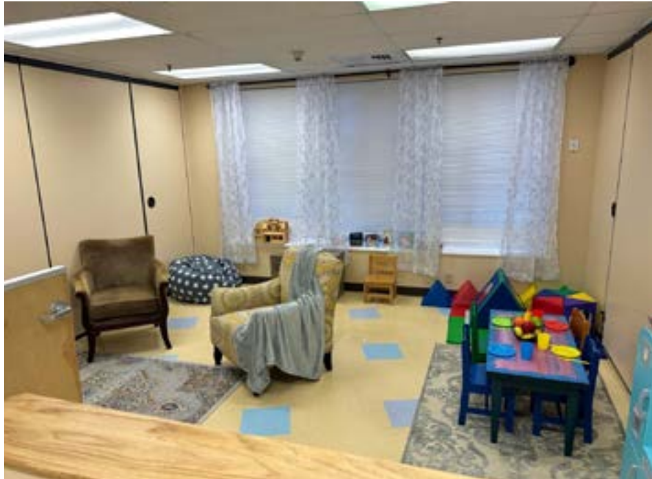
A photo of the newly renovated EI suite where children have the opportunity to play and learn with their clinician and caregivers.

"This gift is transformational for families during a critical point in their young child's development,"