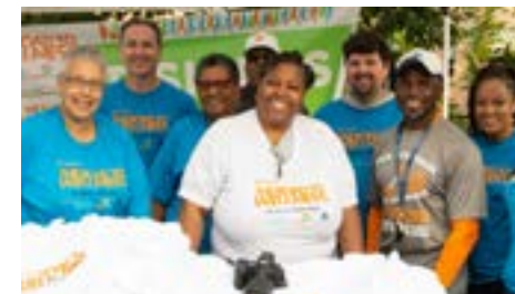
Thank you to the many Road to Wellness volunteers who made this community celebration a success.