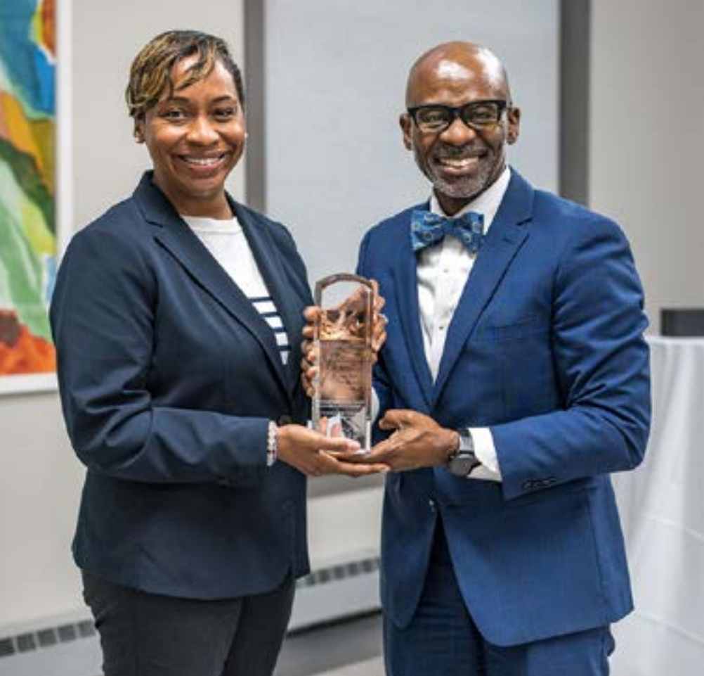
At our Annual Meeting, we were happy to present the Congressman John Lewis Social Justice Award to Massachusetts Attorney General Andrea Joy Campbell for her tireless commitment to creating a more equitable Boston.