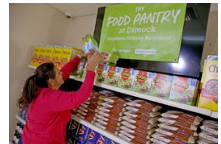
Dimock's Community Outreach team helps keep the shelves stocked at the new on-campus food pantry.

Thank you Stop & Shop for continuing to nourish the Dimock community!