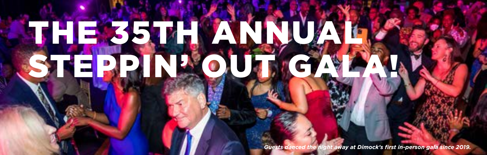
Guests danced the night away at Dimock's first in-person gala since 2019.

The Dimock Family was thrilled to reunite in person for the 35th Annual Steppin' Out gala at the Boston Convention and Exhibition Center! Guests mixed, mingled, and danced the night away, and heard stories of strength and impact from the Dimock community. Thanks to your generous support, together we raised over $1 million of critical funds to support patient care, mental health support, and early education for Dimock families.