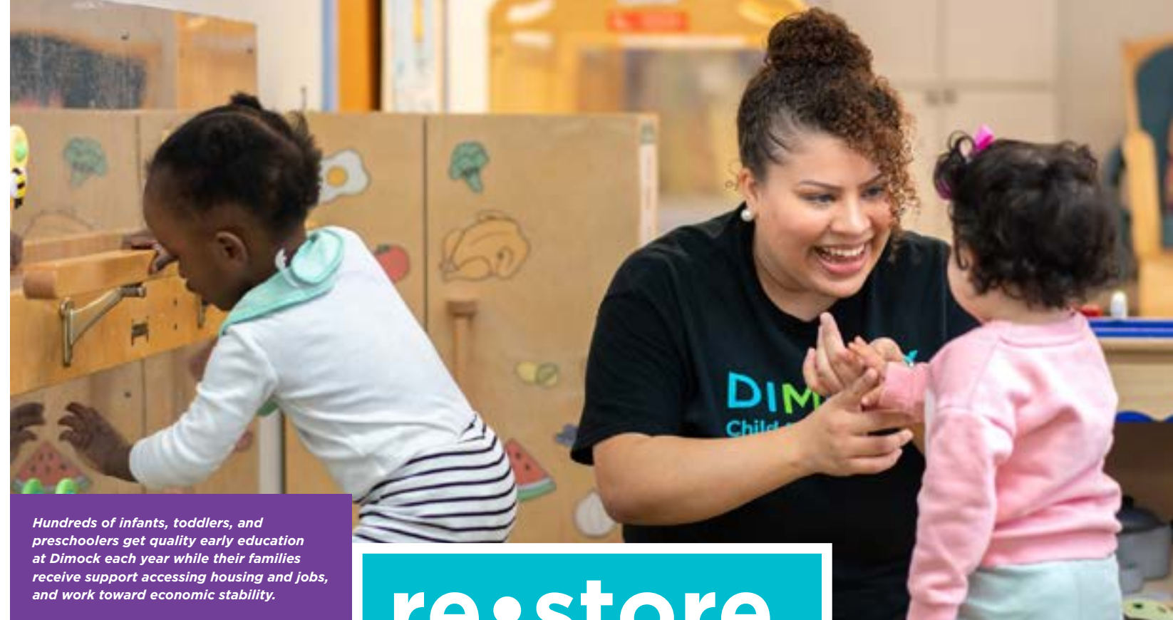
Hundreds of infants, toddlers, and preschoolers get quality early education at Dimock each year while their families receive support accessing housing and jobs, and work toward economic stability.