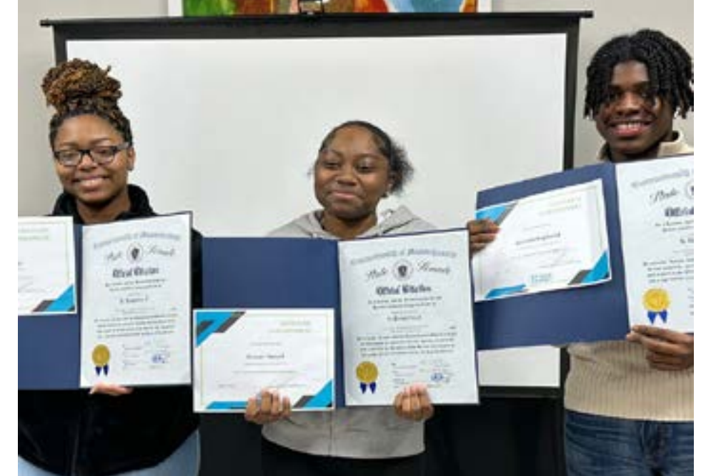
Dimock partnered with WellWithAll and New Academy Estates to train Roxbury teens on how to take blood pressure readings and become heart health advocates in their community. The teens call themselves "Heart Health for the Hood" or "H3" for short.