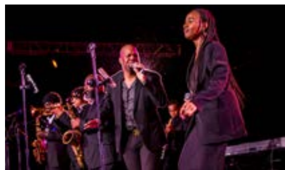
We were thrilled to have live music by Berklee College of Music, who also provides music therapy to patients in Dimock's residential recovery homes.