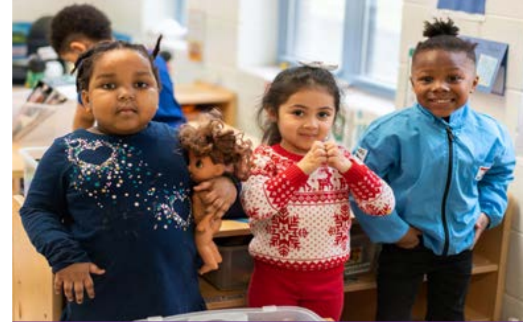
Our Child and Family Services programs provide educational and support services for families with children from birth through age five.