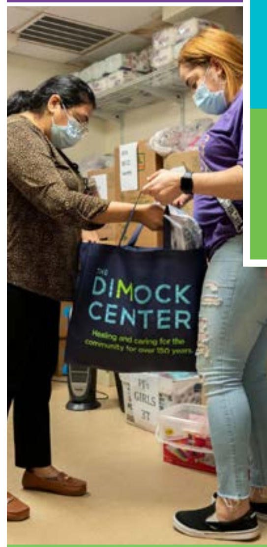
Families in need of material support can access essential items like clothing, diapers, books, hygiene products, and more through Dimock's Resource Care program.