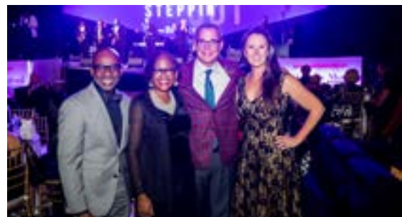
Steppin' Out was once again presented by longtime Dimock partner, The TJX Companies, Inc.