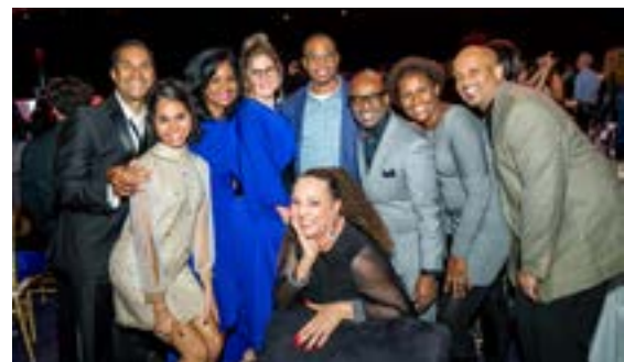
The Dimock Family reunited at the 35th Annual Steppin' Out on October 22, 2022.