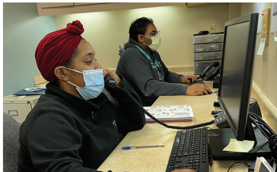
Resource Coordinators offer patients personalized phone and in-person support.